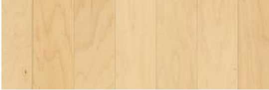
NATURAL 3" plank - EHC3200 5" plank - EHC5200