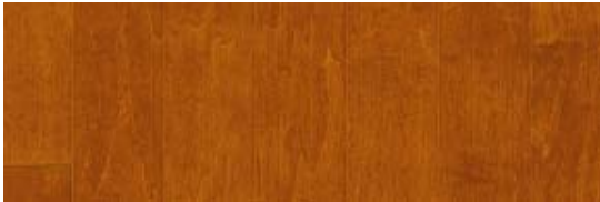
COUNTRY CINNAMON 3" plank - EHC3202 5" plank - EHC5202