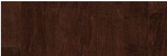
COCOA BROWN 3" plank - EHC3204 5" plank - EHC5204