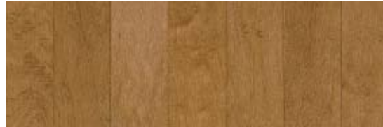
COUNTRY ANTIQUE 3" plank - EHC3203 5" plank - EHC5203