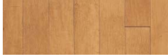
COUNTRY CARAMEL 3" plank - EHC3201 5" plank - EHC5201